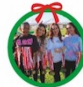
Male & Female Brackets